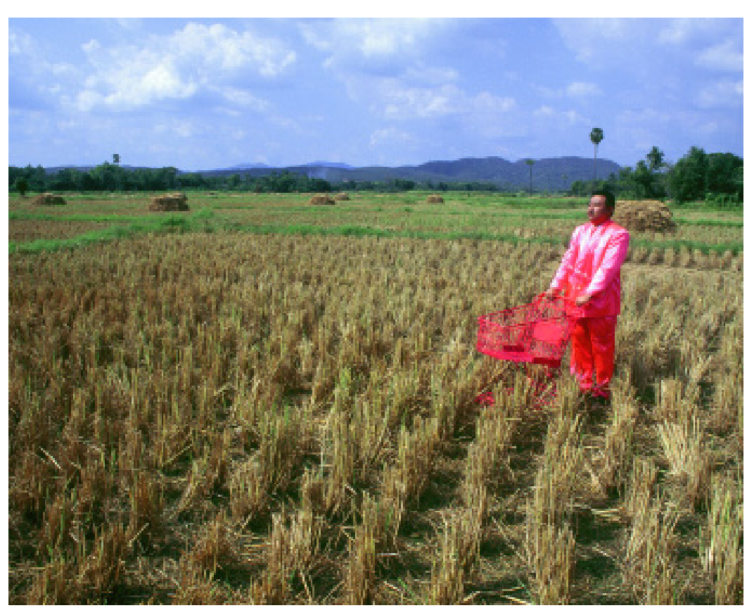
Fig. 3 Manit Sriwanichpoom, Pink Man on Tour (Amazing Rice Field, Northern Thailand) , 1998, C print mounted on aluminium, 50×60 cm.

Manit's example indicates the reification of a national/ international dichotomy which often collapsed the critical distance required to appreciate the irony of his critiques of nationalism. While international audiences might appreciate the artist's 'sociopolitical' position, as Jim Supangkat has recognised, this also had the potential to reaffirm the distinction between self and other, formulated as the politically 'developed' and 'undeveloped.' In this regard, photography was eminently suitable to the requirements of the Biennial model, its ontology intersecting with the desire for contemporaneity in several ways. In particular, photography's documentary and archival legacy historically