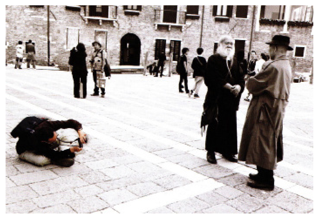
Fig. 7 Hassapop Tangmahamek, Trying , 2011, digital print 50.6×76.2 cm.

that the audience saw Inson's story through Navin's comic narrative...Inson's voice was absented (sic) from telling the story of himself, since all the installations and narrative were narrated by Navin.<sup>61</sup>