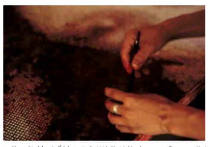
Fig. 10 Kosit Juntaratip, Happy Birthday, (24^{th} July in 1994), 1994, Kosit's blood on canvas (bio material), 180\times240 cm. Ideal Art Gallery, Bangkok, Thailand.