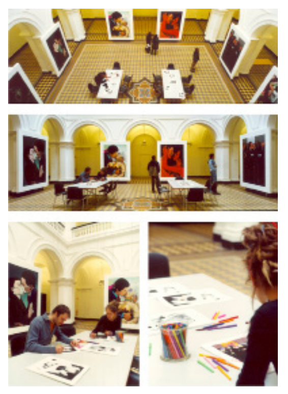
Fig. 11 Kosit Juntaratip, Kiss, 2003, digital photography and audience participation on Kiss colouring, dimensions variable. Academy of Visual Arts Leipzig, Germany.

of mise en abyme thus "endows...photographs with an apparatus for self-interpretation; their structure, defined by the juxtaposition of two images of the same motif, gives rise to the commentary on the conditions of the photograph itself." <sup>70</sup>