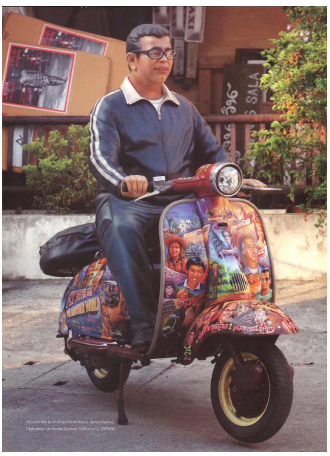
Fig. 8 Navin Rawanchaikul, Fly with me to another world, 2008, mixed media installation, dimensions variable. Exhibited as part of Fly with me to another world, Dhamma Park Foundation, Lamphun, Thailand, 2009.