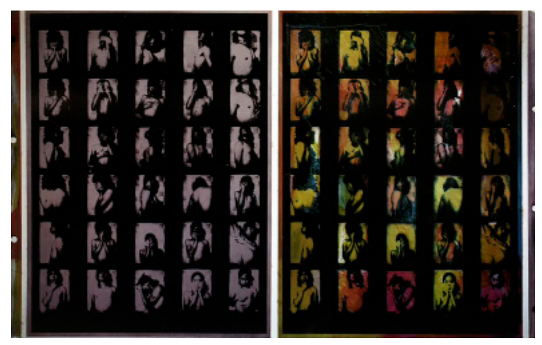
Fig. 1 Pramuan Burusphat, Autobiographical Images #25, 1978, Kwik Print, 36×56 cm. Image courtesy of the artist.