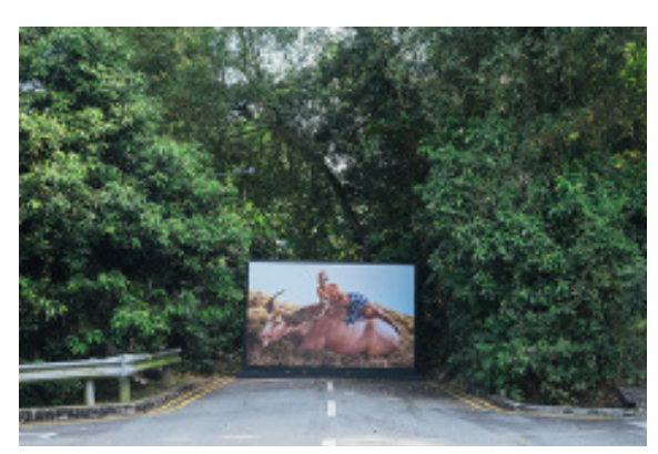
Fig. 5 Maitree Siriboon, Dream of Beyond Part 2 , 2010, photograph light box, 300×450×50 cm. Exhibited as part of Gillman Barracks' public art showcase LOCK ROUTE , 2017.

chequered cloth that has been used in Thailand since the 11<sup>th</sup> century) around his waist. Yet these conspicuous signs are catapulted into the space of the audience, through a synchronicity between the hay upon which the buffalo lays and the natural landscape in which the image is displayed.